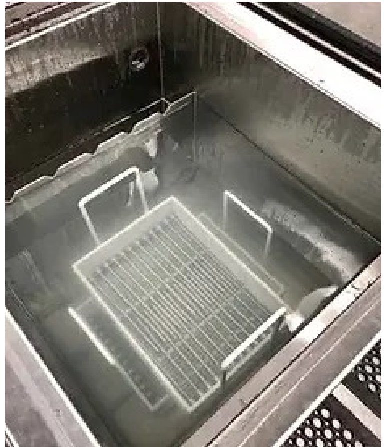
Pickling / Passivation bath